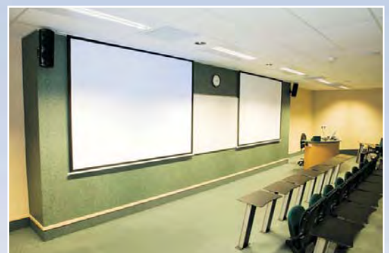
The photograph shows the corner of a video screen slot with the video screen extended.

Manufactured in New Zealand by Production Systems Ltd